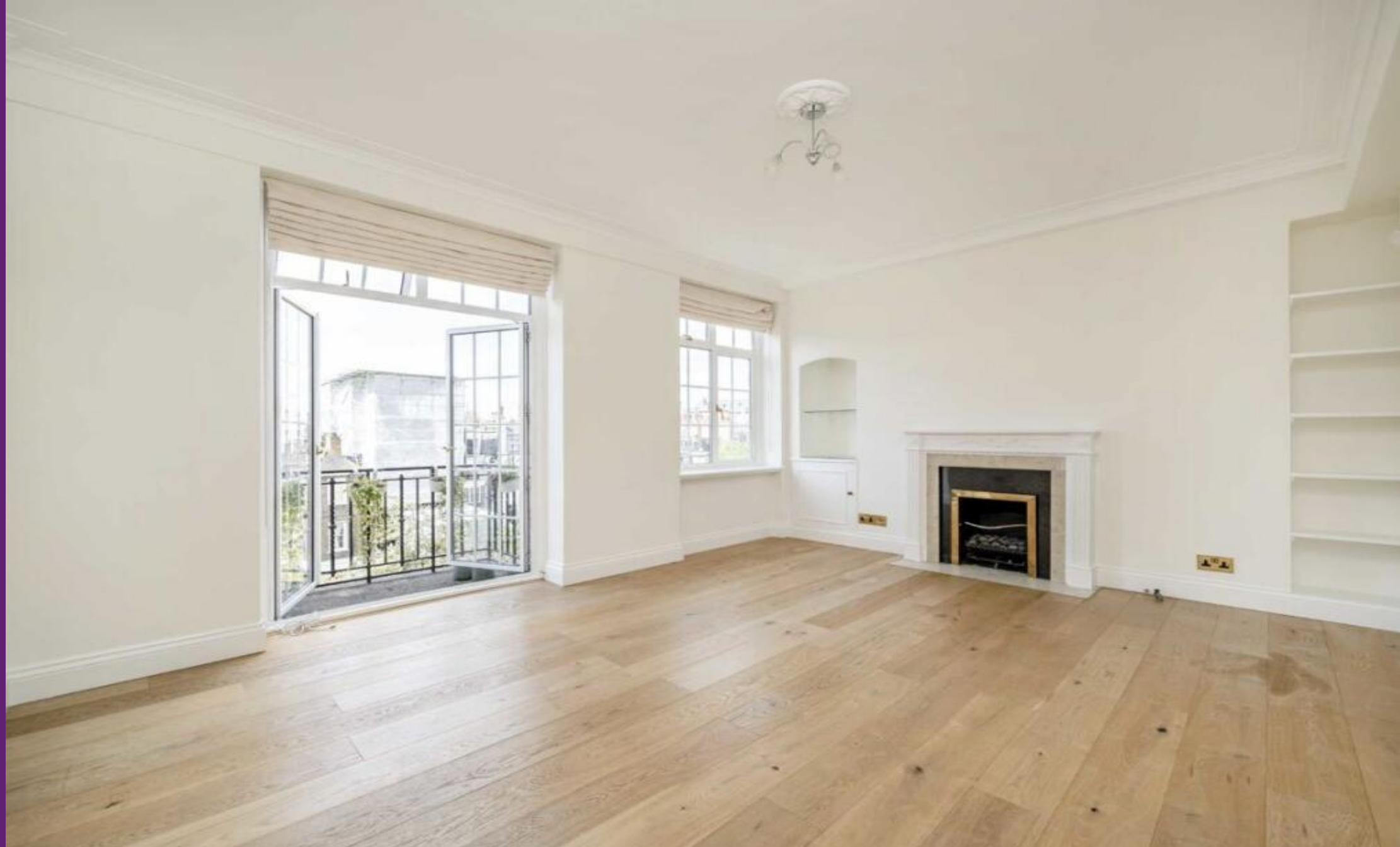
Shrewsbury House Cheyne Walk, SW3