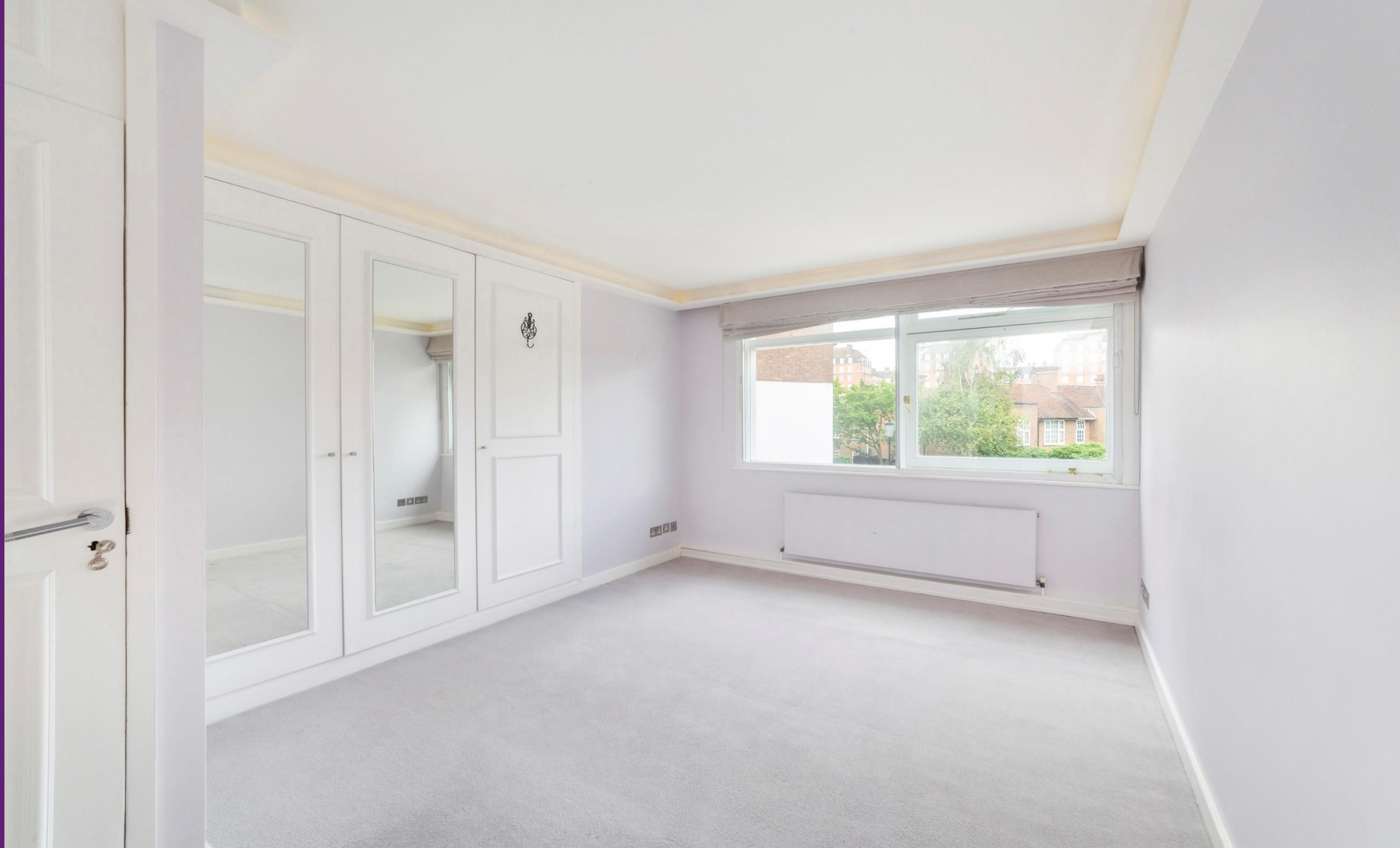
Ranelagh House 3-5 Elystan Place, SW3