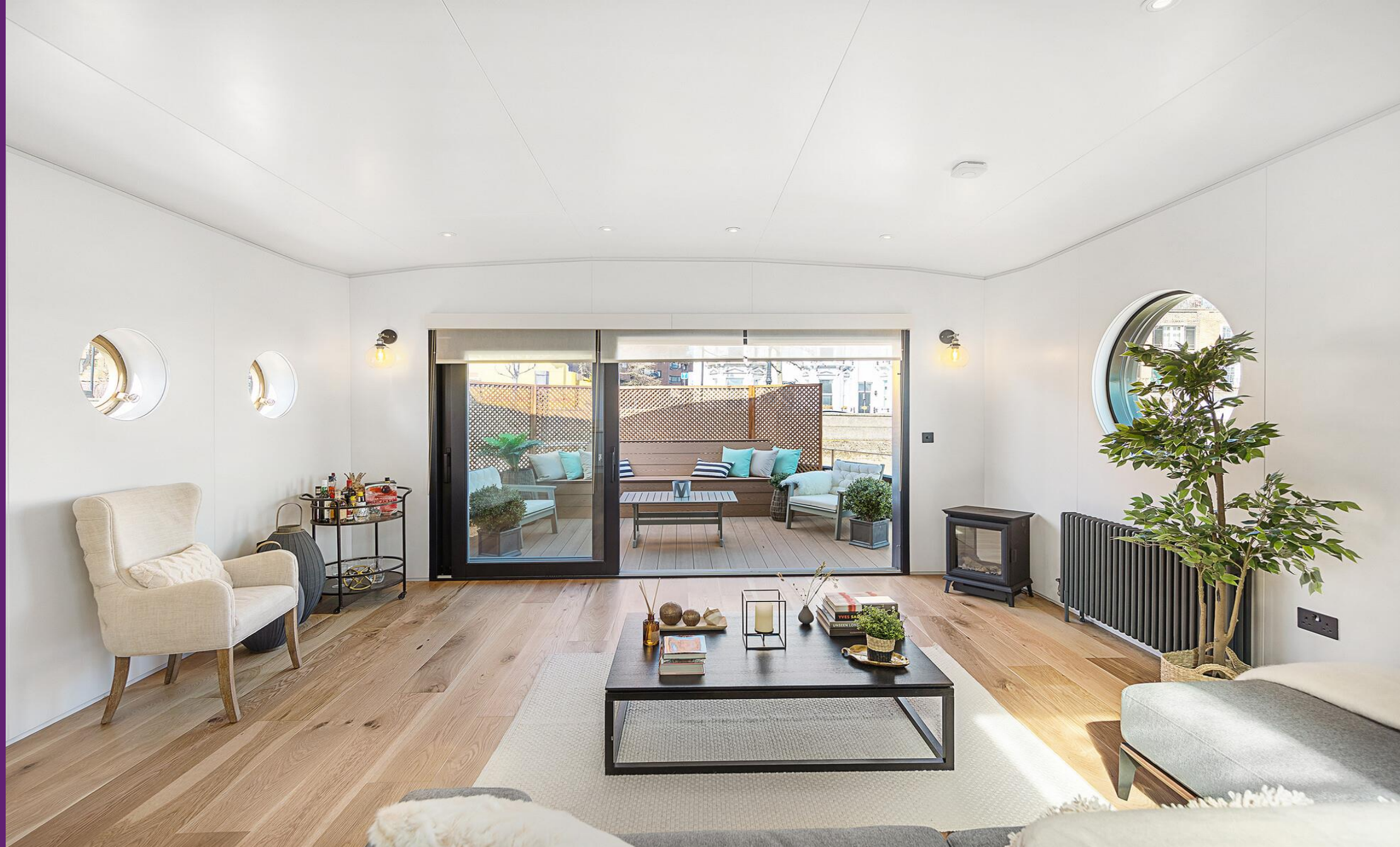
Cheyne Pier Cheyne Walk, SW10