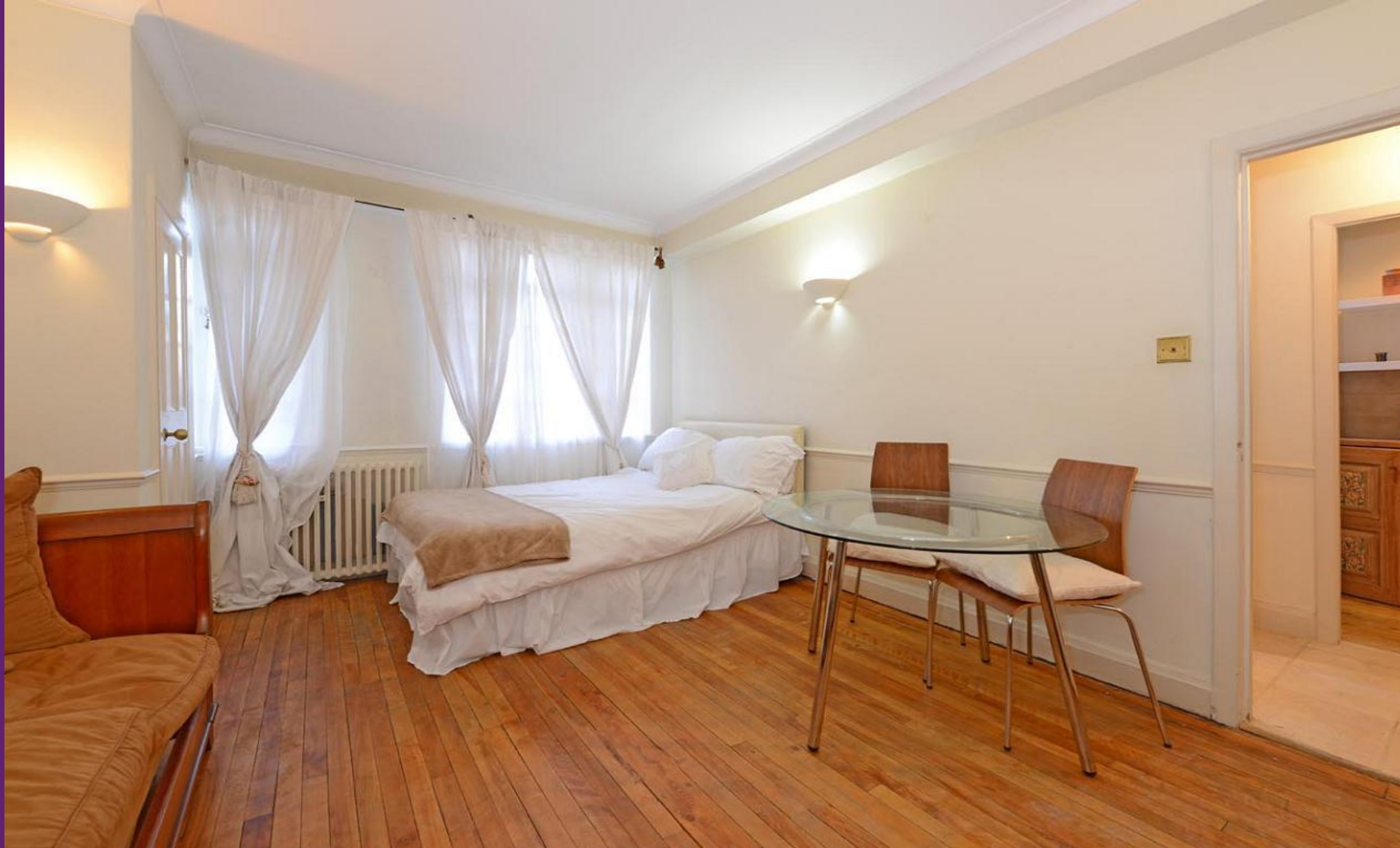
Nell Gwynn House Sloane Avenue, SW3