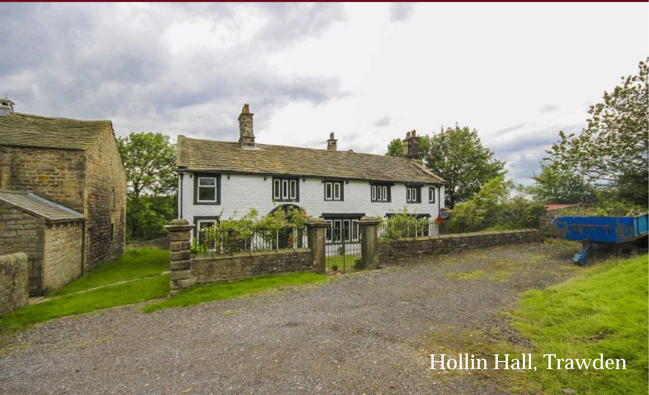
Hollin Hall, Trawden