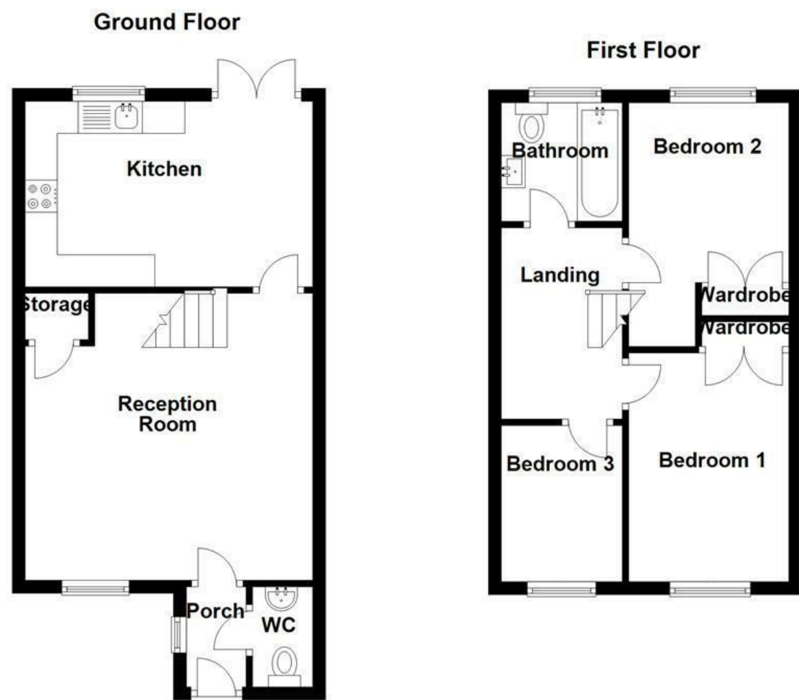
All floorplans are for guidance only. Not to scale. Please check all dimensions and shapes before making any decisions reliant upon them. Plan produced using PlanUp.