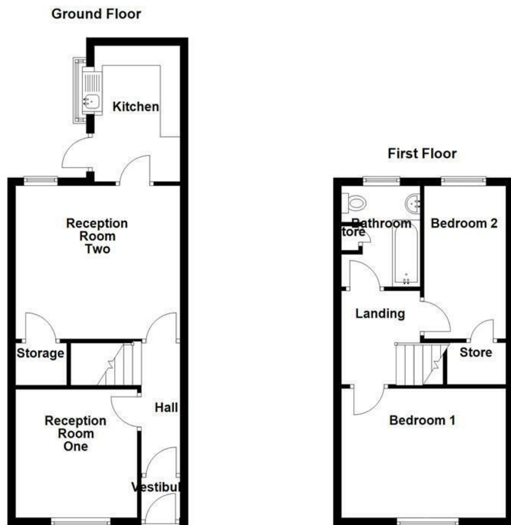
All floorplans are for guidance only. Not to scale. Please check all dimensions and shapes before making any decisions reliant upon them. Plan produced using PlanUp.