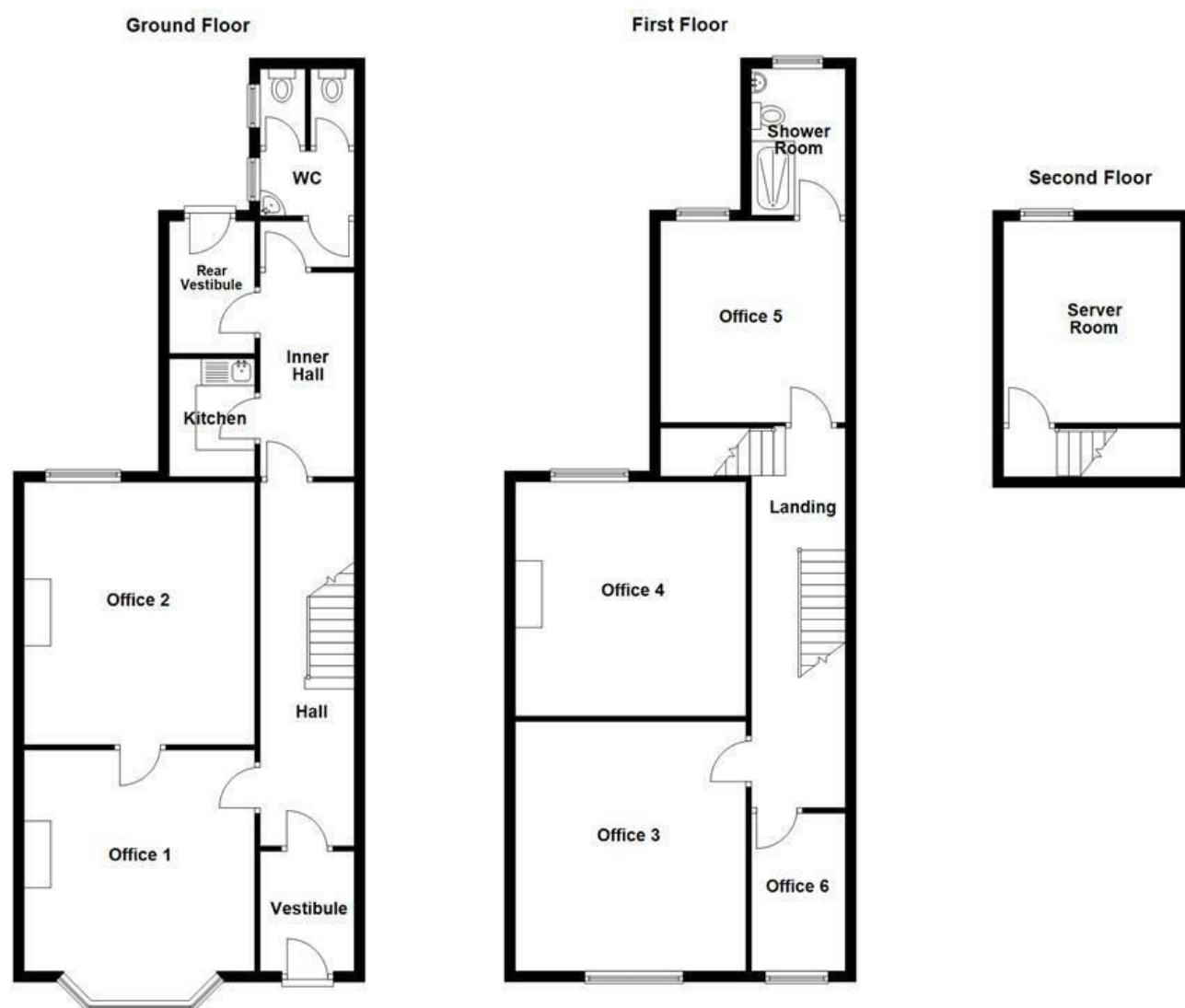
All floorplans are for guidance only. Not to scale. Please check all dimensions and shapes before making any decisions reliant upon them. Plan produced using PlanUp.