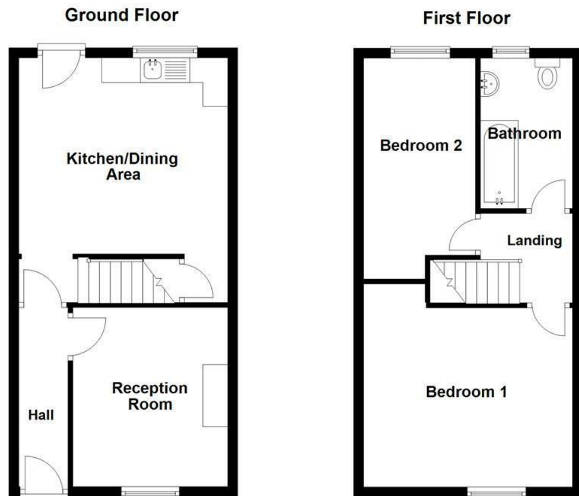
All floorplans are for guidance only. Not to scale. Please check all dimensions and shapes before making any decisions reliant upon them. Plan produced using PlanUp.