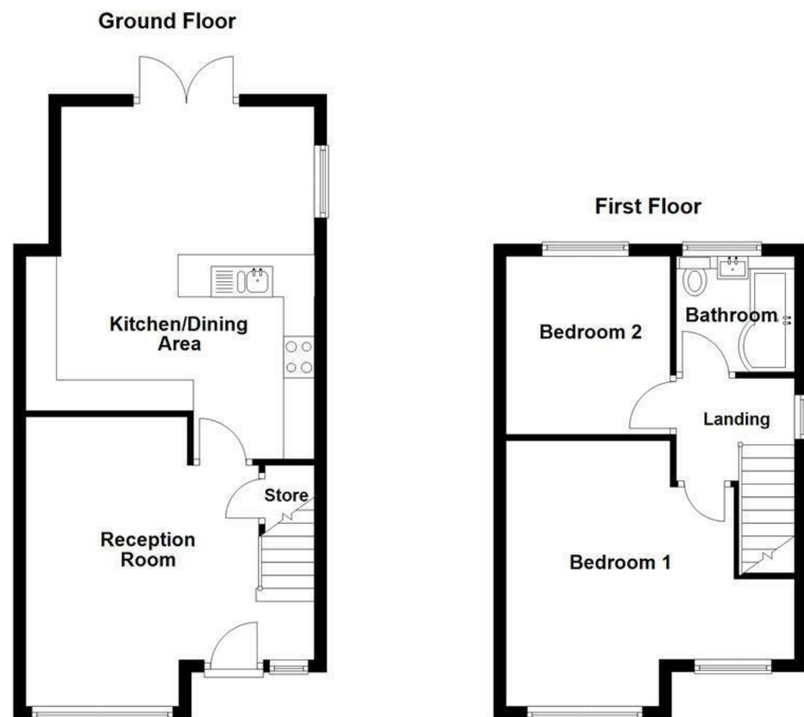
All floorplans are for guidance only. Not to scale. Please check all dimensions and shapes before making any decisions reliant upon them. Plan produced using PlanUp.