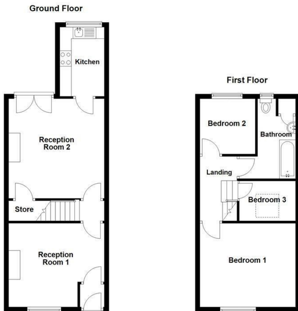
All floorplans are for guidance only. Not to scale. Please check all dimensions and shapes before making any decisions reliant upon them. Plan produced using PlanUp.