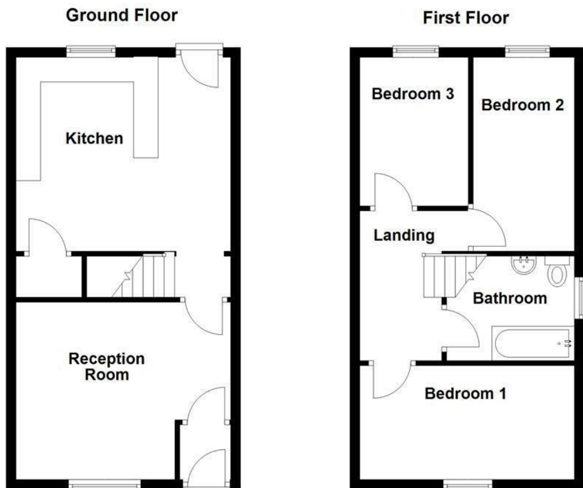
All floorplans are for guidance only. Not to scale. Please check all dimensions and shapes before making any decisions reliant upon them. Plan produced using PlanUp.