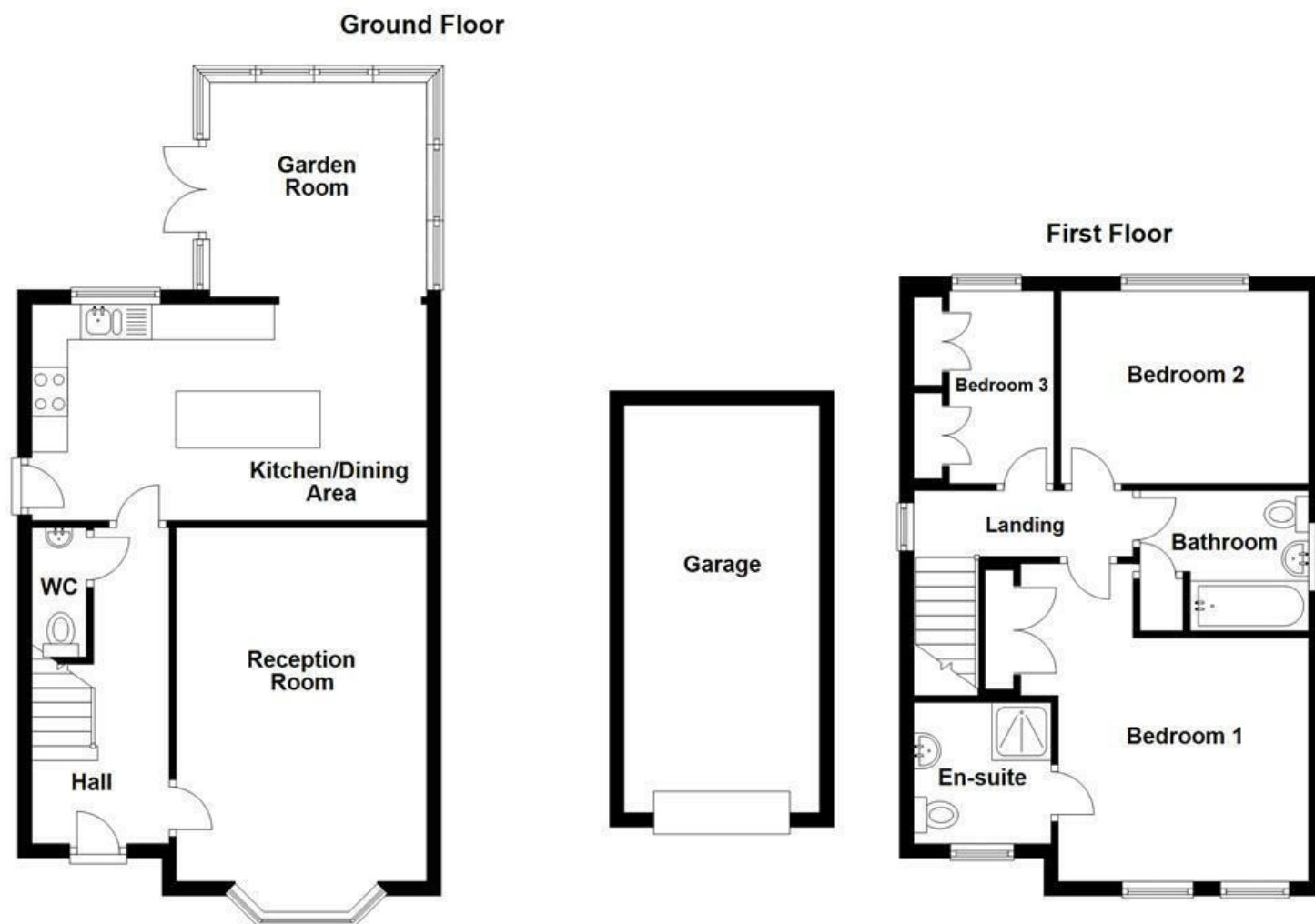
All floorplans are for guidance only. Not to scale. Please check all dimensions and shapes before making any decisions reliant upon them. Plan produced using PlanUp.