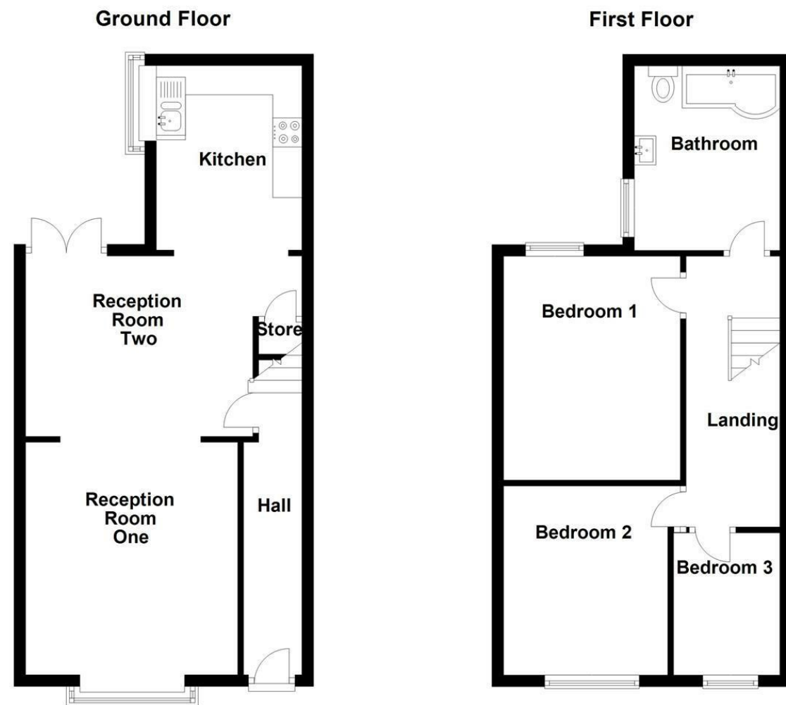
All floorplans are for guidance only. Not to scale. Please check all dimensions and shapes before making any decisions reliant upon them. Plan produced using PlanUp.