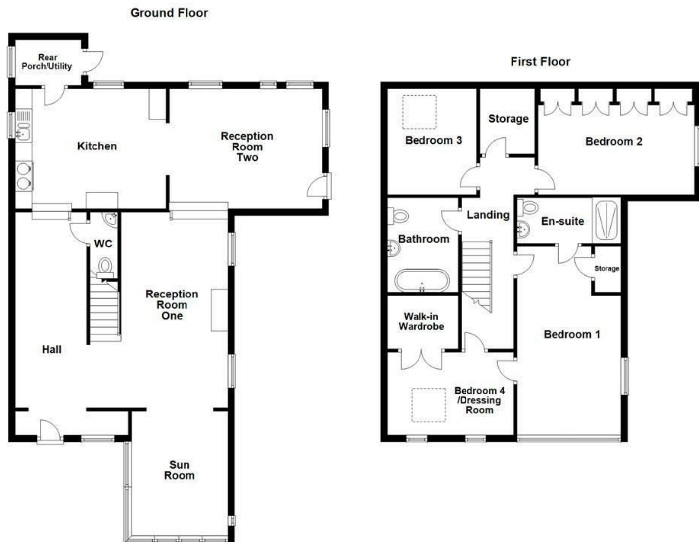
All floorplans are for guidance only. Not to scale. Please check all dimensions and shapes before making any decisions reliant upon them. Plan produced using PlanUp.