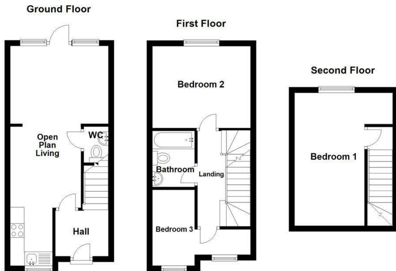
All floorplans are for guidance only. Not to scale. Please check all dimensions and shapes before making any decisions reliant upon them. Plan produced using PlanUp.