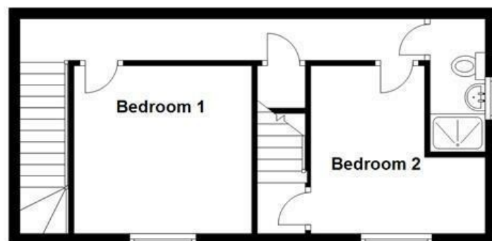
First Floor Approx. 368.4 sq. feet