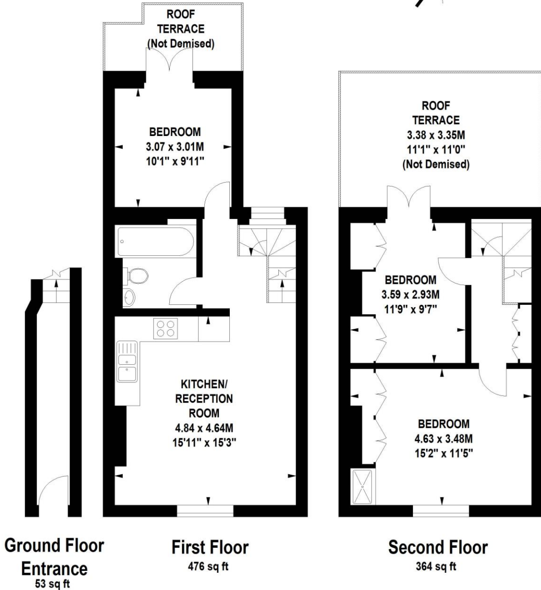
Illustration For Identification Purposes Only. Not To Scale

*Floorplan Drawn According To RICS Guidelines