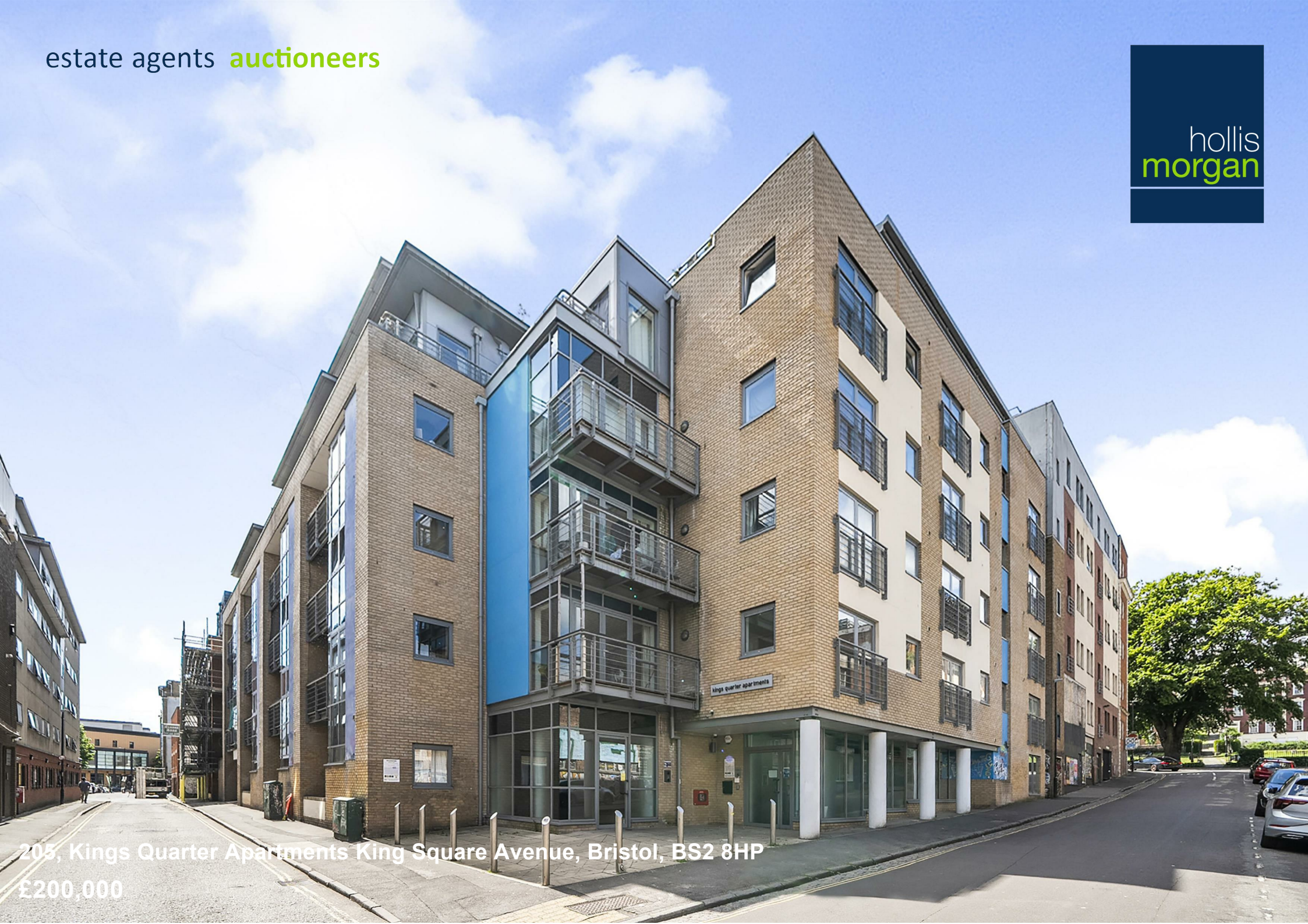
205, Kings Quarter Apartments King Square Avenue, Bristol, BS2 8HP £200,000