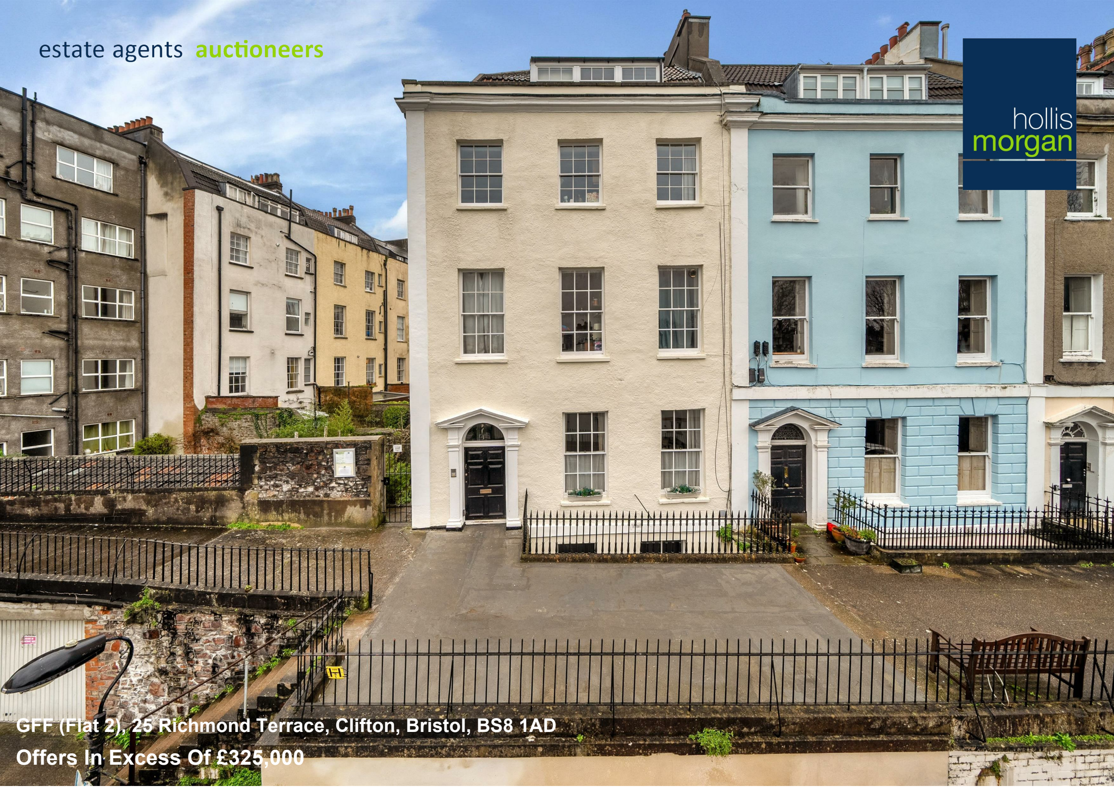
GFF (Flat 2), 25 Richmond Terrace, Clifton, Bristol, BS8 1AD Offers In Excess Of £325,000