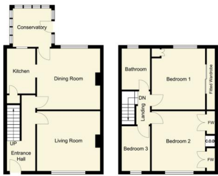
Ground Floor First Floor 194 Crackenedge Lane