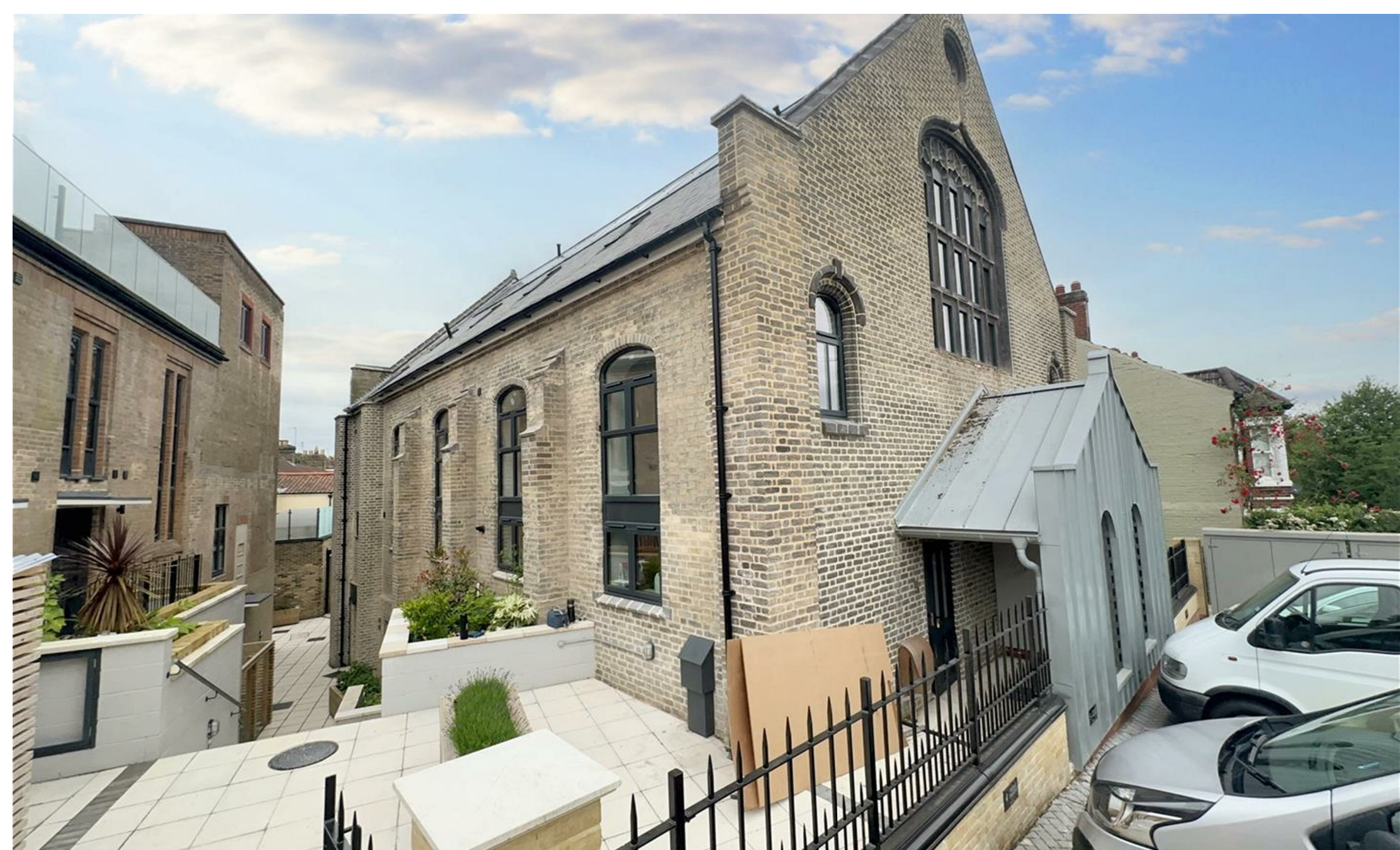
The Chapters, Park Lane | Norwich | NR2 PCM £1,850 PCM