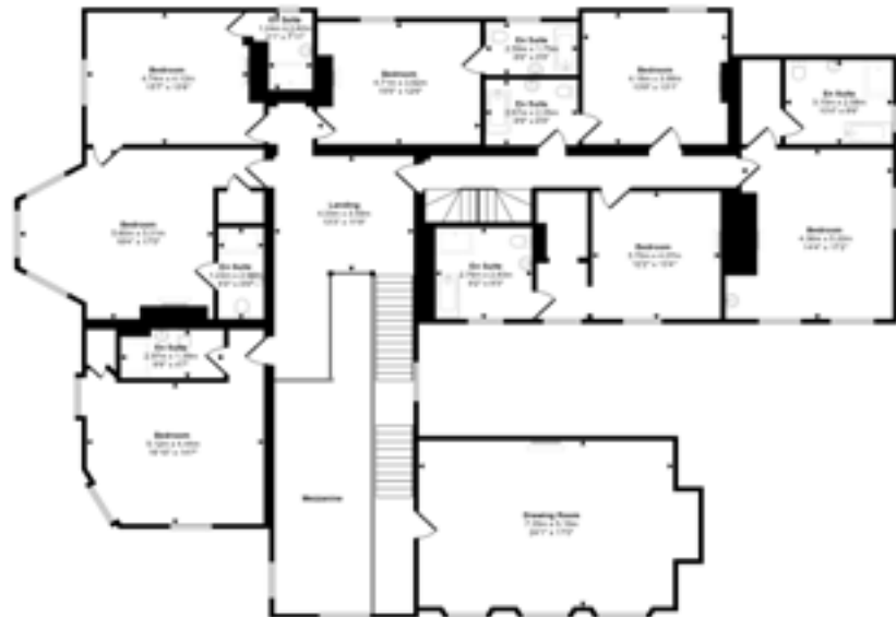
First Floor Scale: 1/8" = 1'-0"