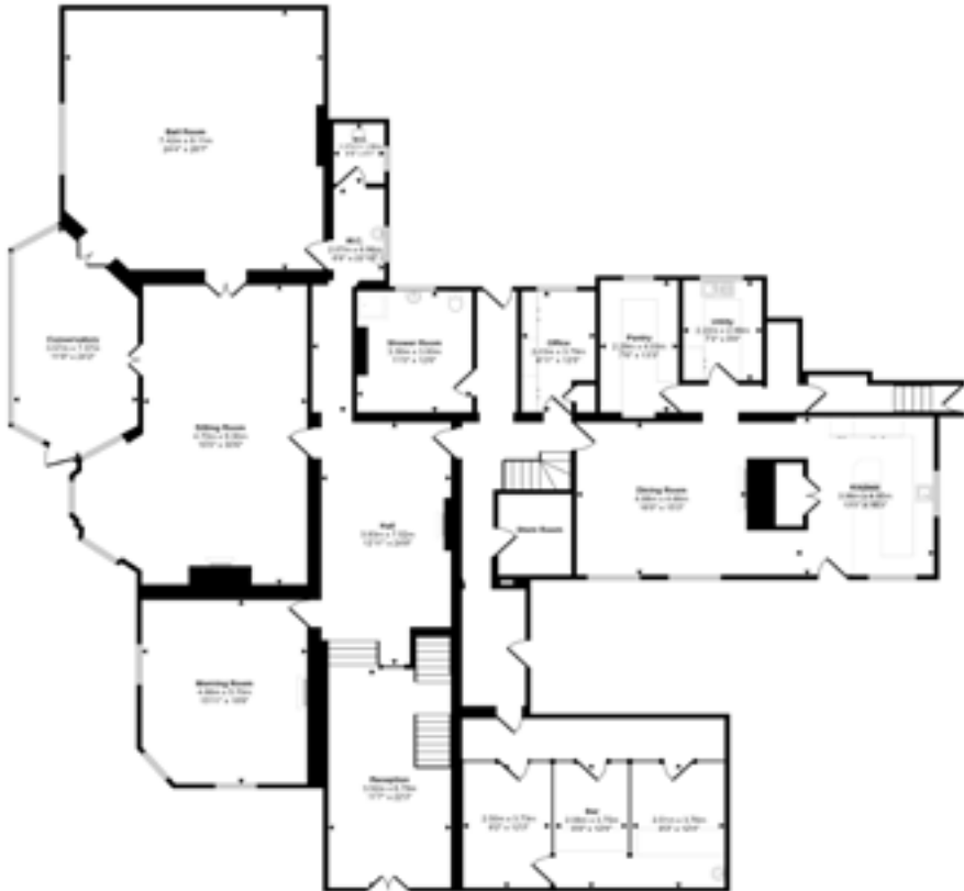
Ground Floor Scale: 1/8" = 1'-0"