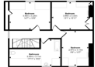
Second Floor Scale: 1/8" = 1'-0"