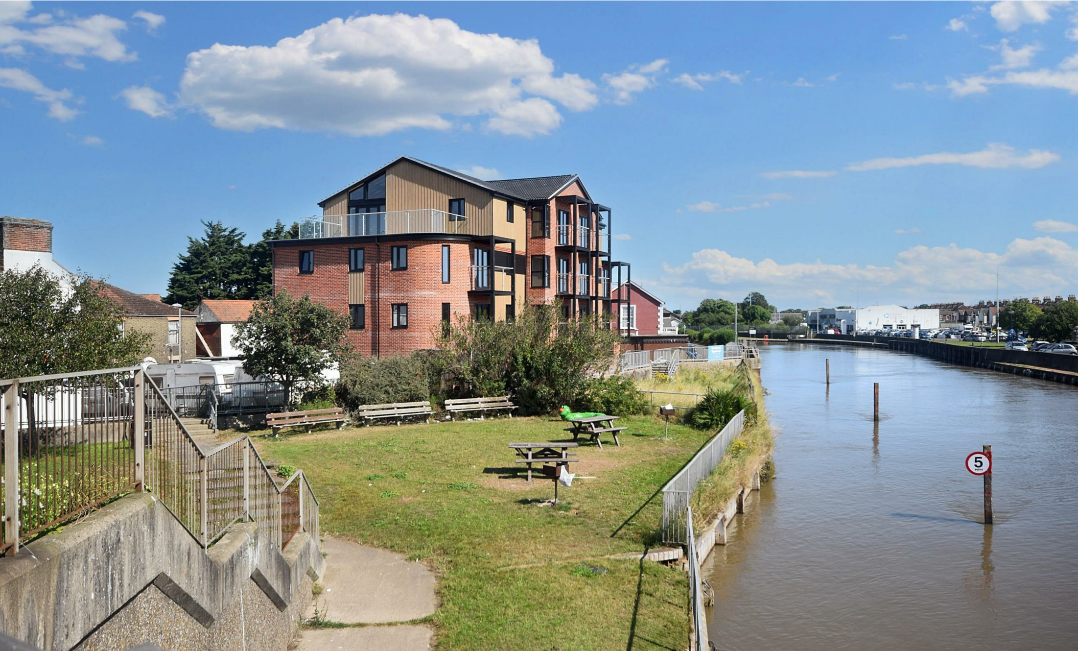
Bridge Road | Great Yarmouth | NR30 Guide Price £180,000