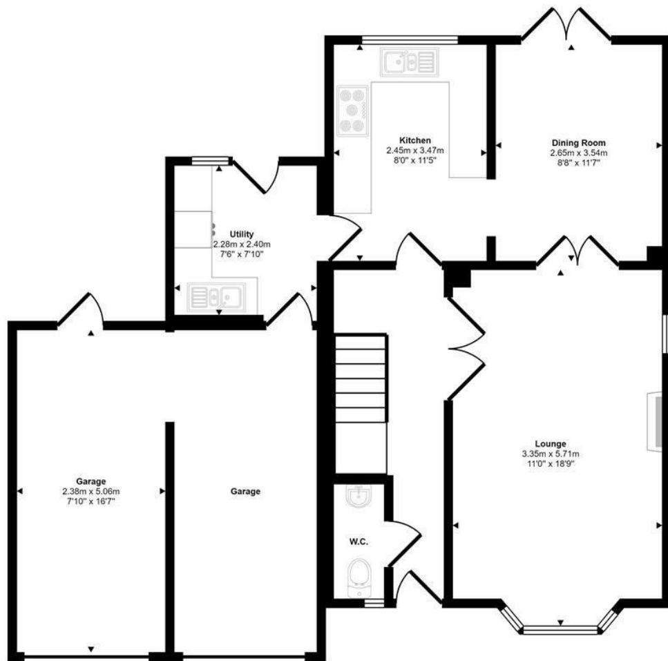
Ground Floor Approx 81 sq m / 868 sq ft

Approx Gross Internal Area 128 sq m / 1382 sq ft