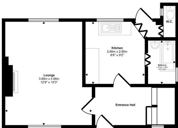
Ground Floor Approx 36 sq m / 392 sq ft

Approx Gross Internal Area 73 sq m / 785 sq ft