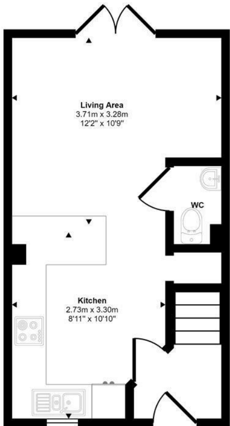
Ground Floor Approx 25 sq m / 270 sq ft

Approx Gross Internal Area 50 sq m / 541 sq ft