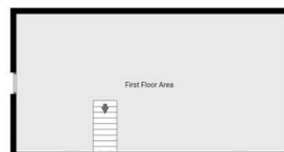
THIS FLOORPLAN IS PROVIDED WITHOUT WARRANTY OF ANY KIND. EPC247 DISCLAIMS ANY WARRANTY INCLUDING, WITHOUT LIMITATION, SATISFACTORY QUALITY OR ACCURACY OF DIMENSIONS.