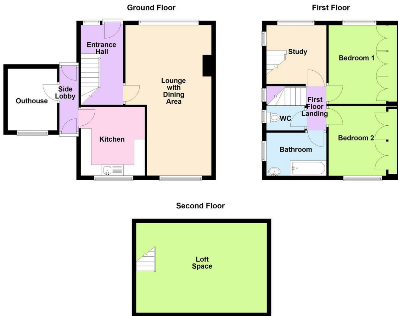
7 Ryedale Grove, Hull