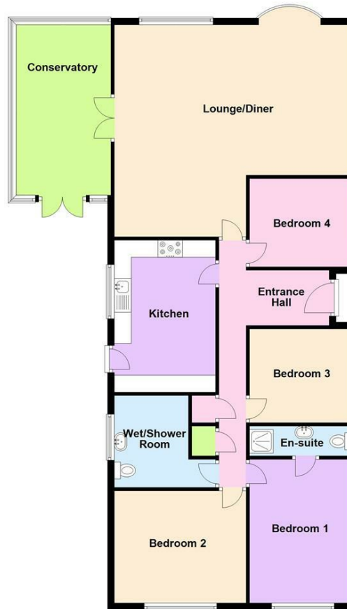
Potential Layout for guidance purposes only. Plan produced using PlanUp.