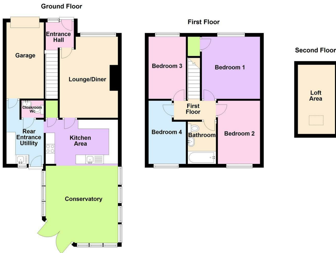
Serangoon , Main Street, Long Riston