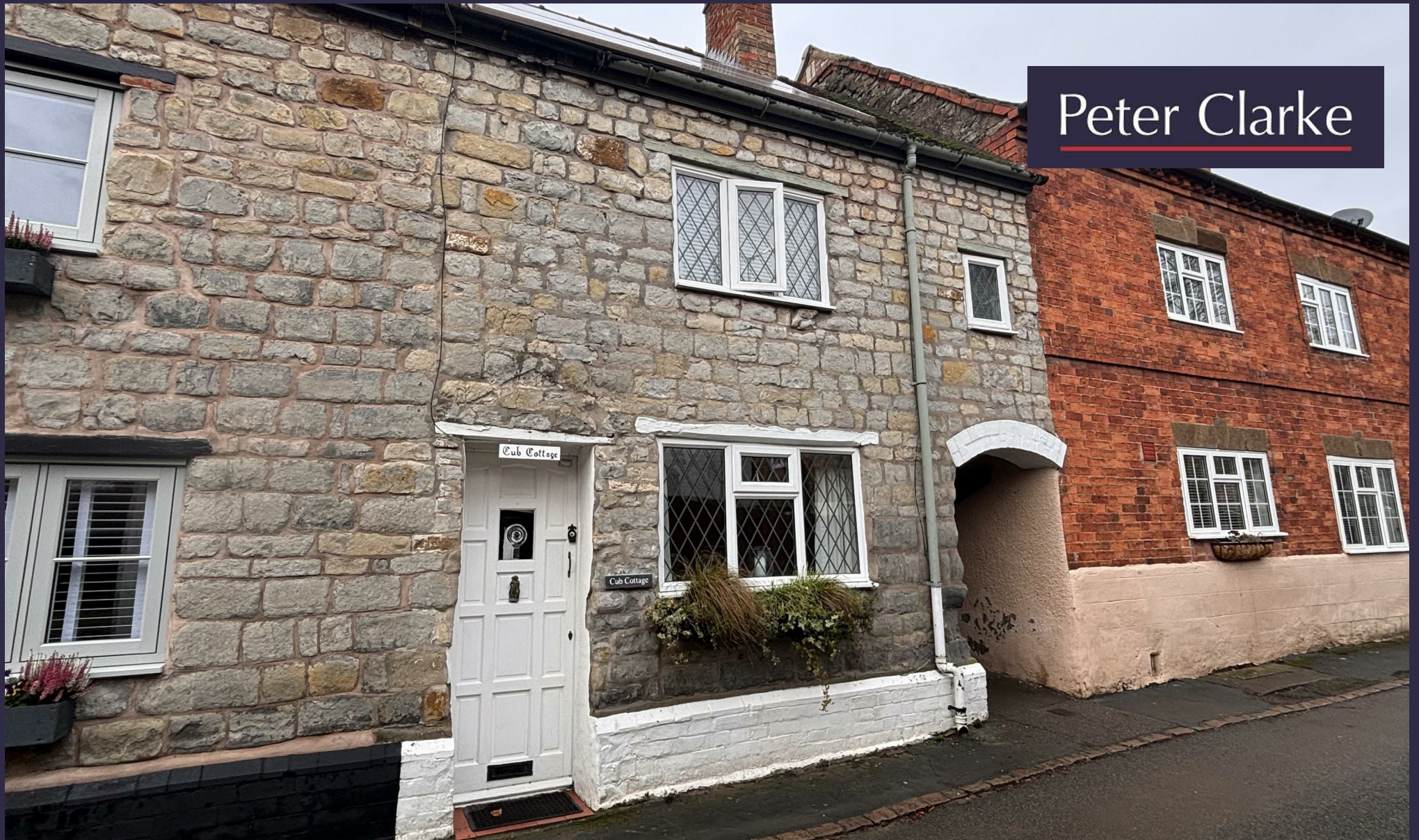
Cub Cottage Market Square, Kineton, Warwick, CV35 0LP