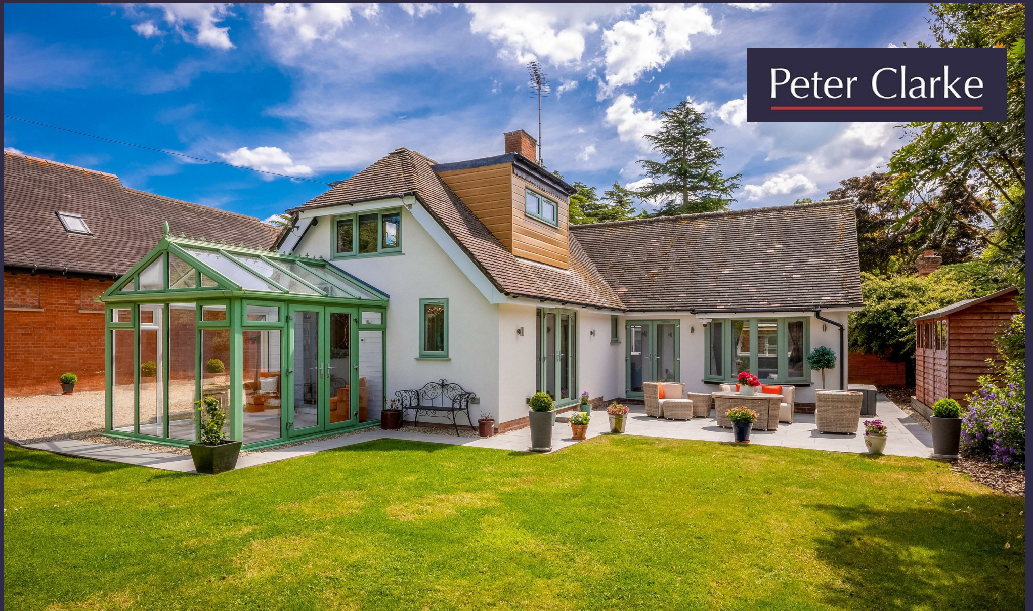
The Laurels, Moreton Paddox, Moreton Morrell, Warwick, CV35 9BU