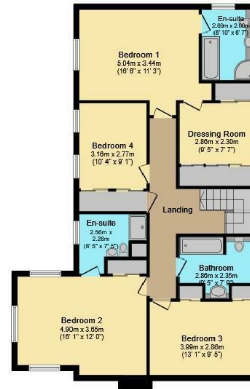
First Floor Floor area 100.2 m 2 (1,078 sq.ft.)