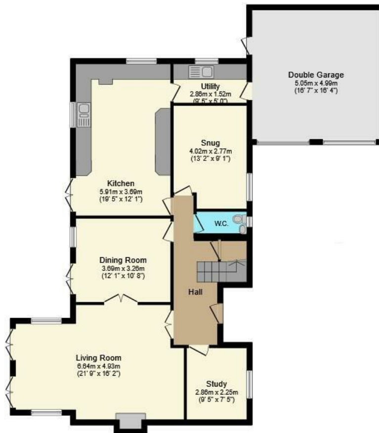
Ground Floor Floor area 122.9 m 2 (1,323 sq.ft.)