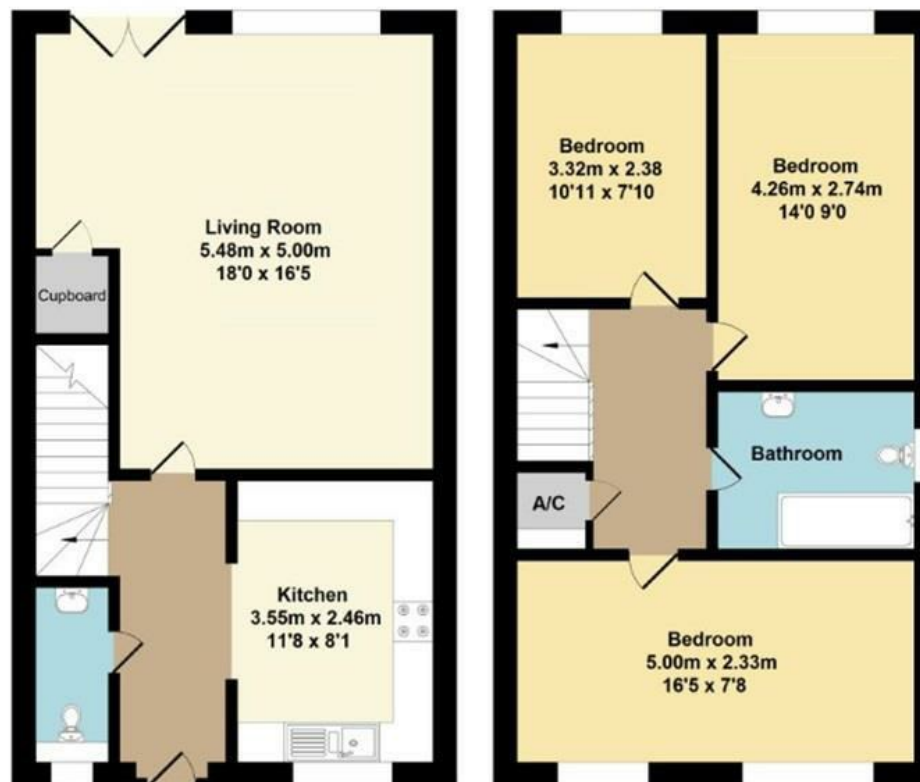
Ground Floor Approx. Floor Area 46.00 Sq.M. (496 Sq.Ft.)

Whilst every attempt has been made to ensure the accuracy of the floor plan contained here, measurements of doors, windows, rooms and any other items are approximate and no responsibility is taken for any error, omission, or mis-statement. This plan is for illustrative purposes only and should be used as such by any prospective purchaser. The services systems and appliance shown have not been tested and no guarantee as to their operability or efficiency can be given.