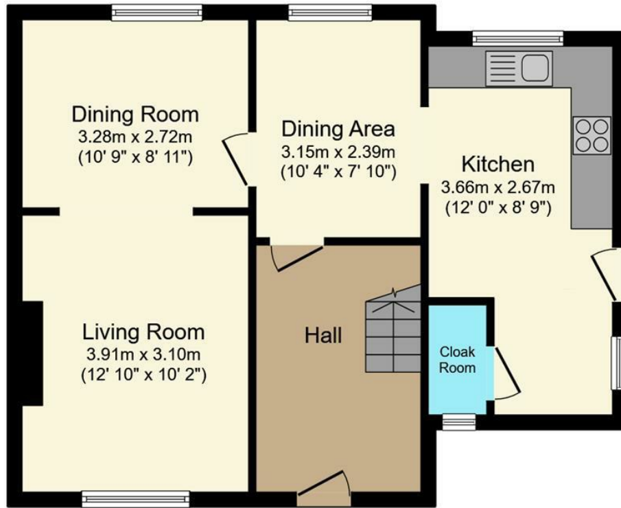
Ground Floor Floor area 54.0 m 2 (582 sq.ft.)