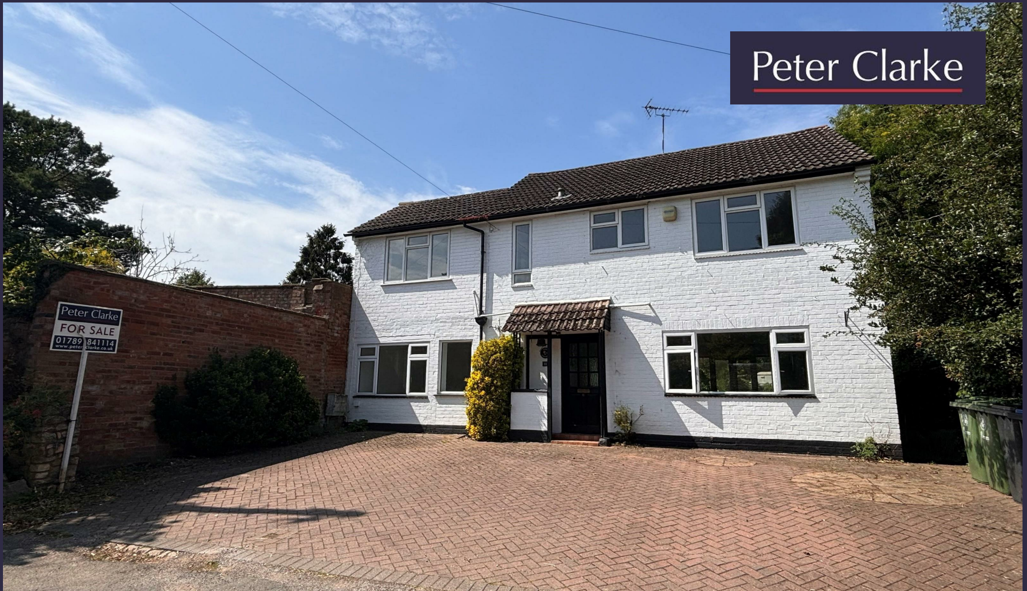
Rose Cottage, 11 Church Walk, Wellesbourne, Warwickshire, CV35 9QT