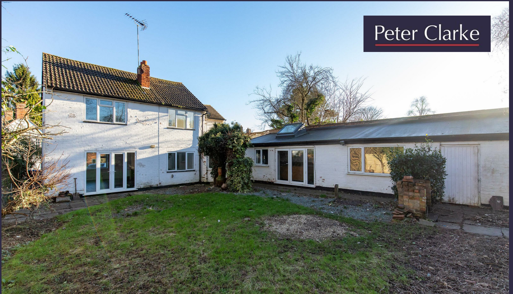
Rose Cottage, 11 Church Walk, Wellesbourne, Warwickshire, CV35 9QT