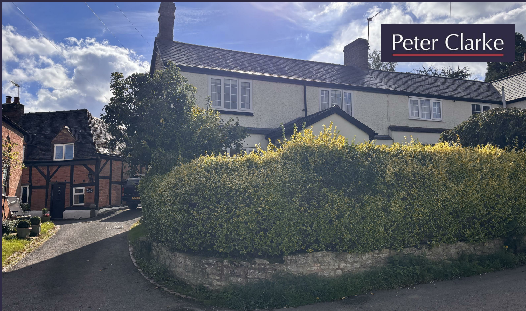
Pleck Cottage Middletown, Moreton Morrell, Warwick, CV35 9AU