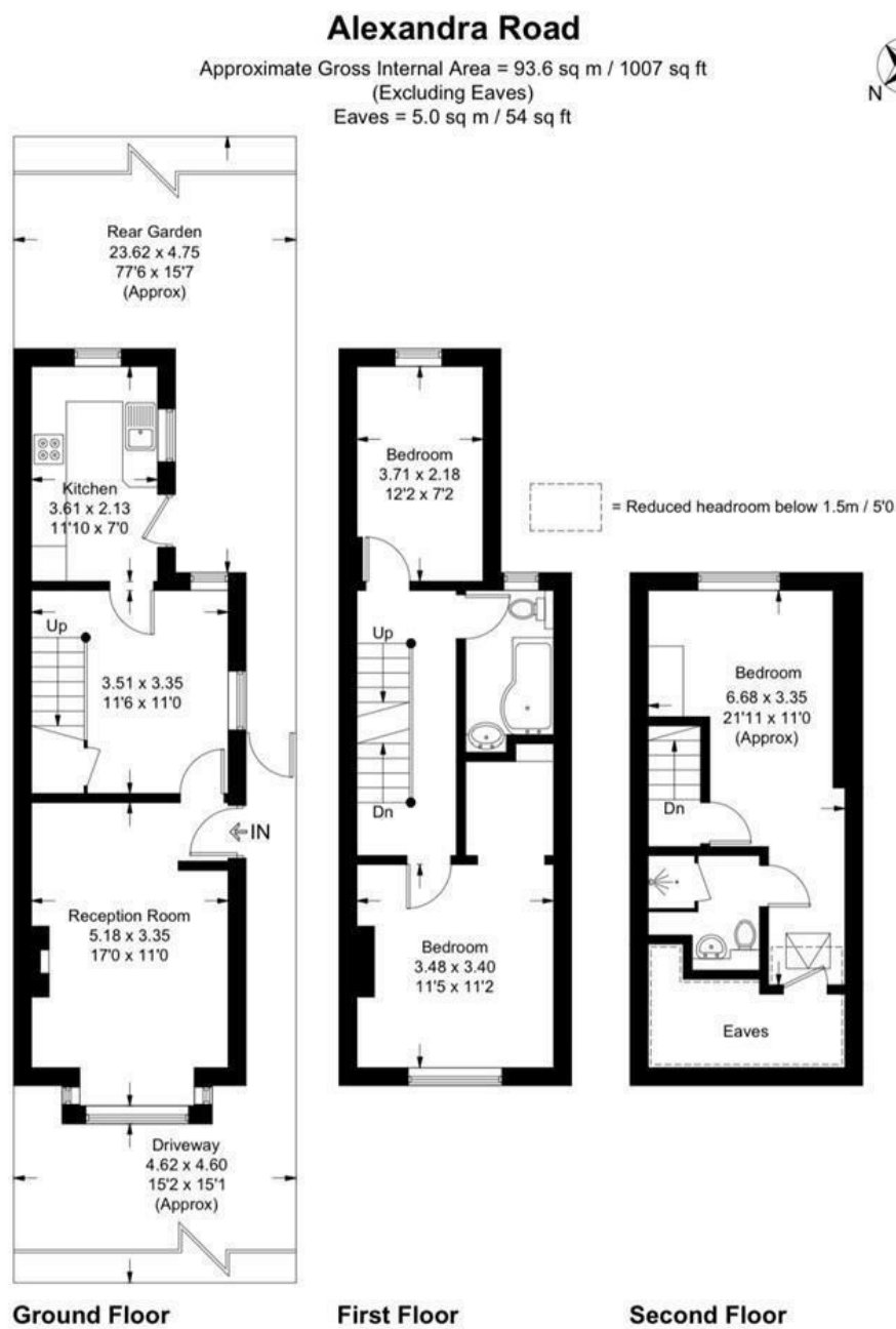
Illustration for identification purposes only, measurements are approximate, not to scale. (ID1261336)