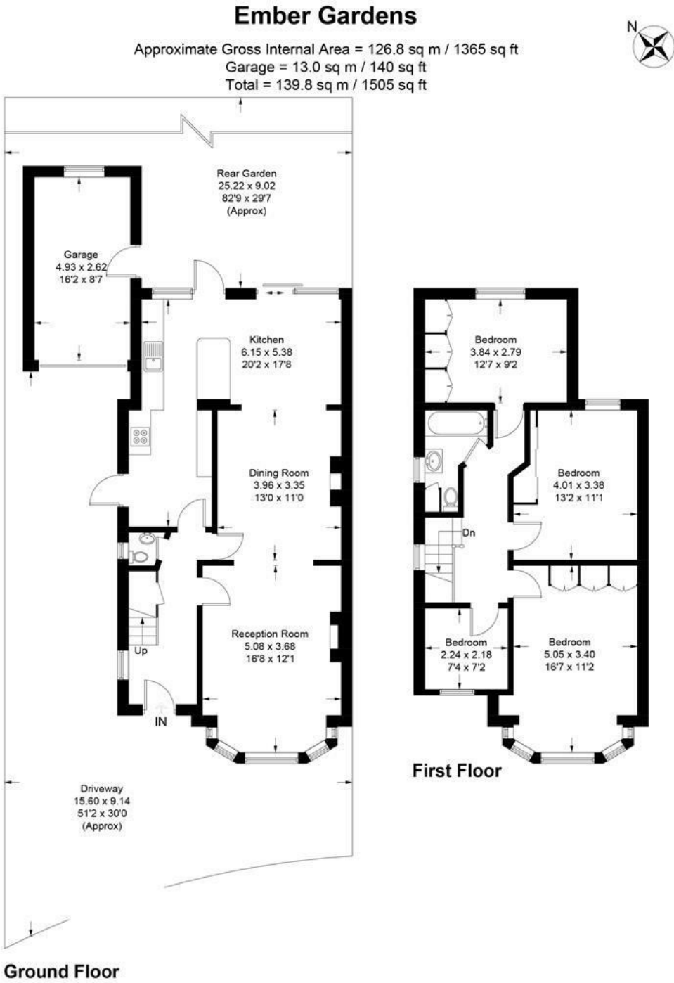
Illustration for identification purposes only, measurements are approximate, not to scale. (ID1260359)