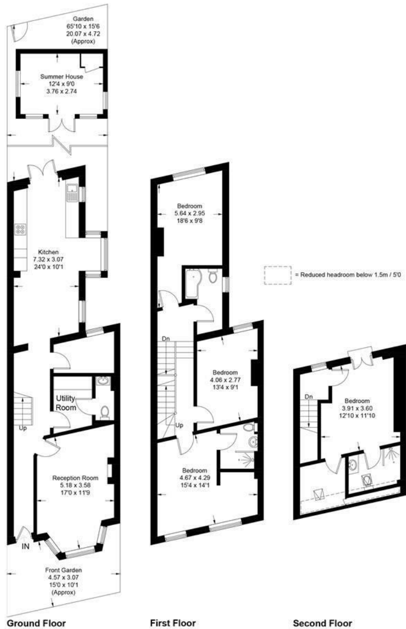
Illustration for identification purposes only, measurements are approximate, not to scale. (ID1190241)