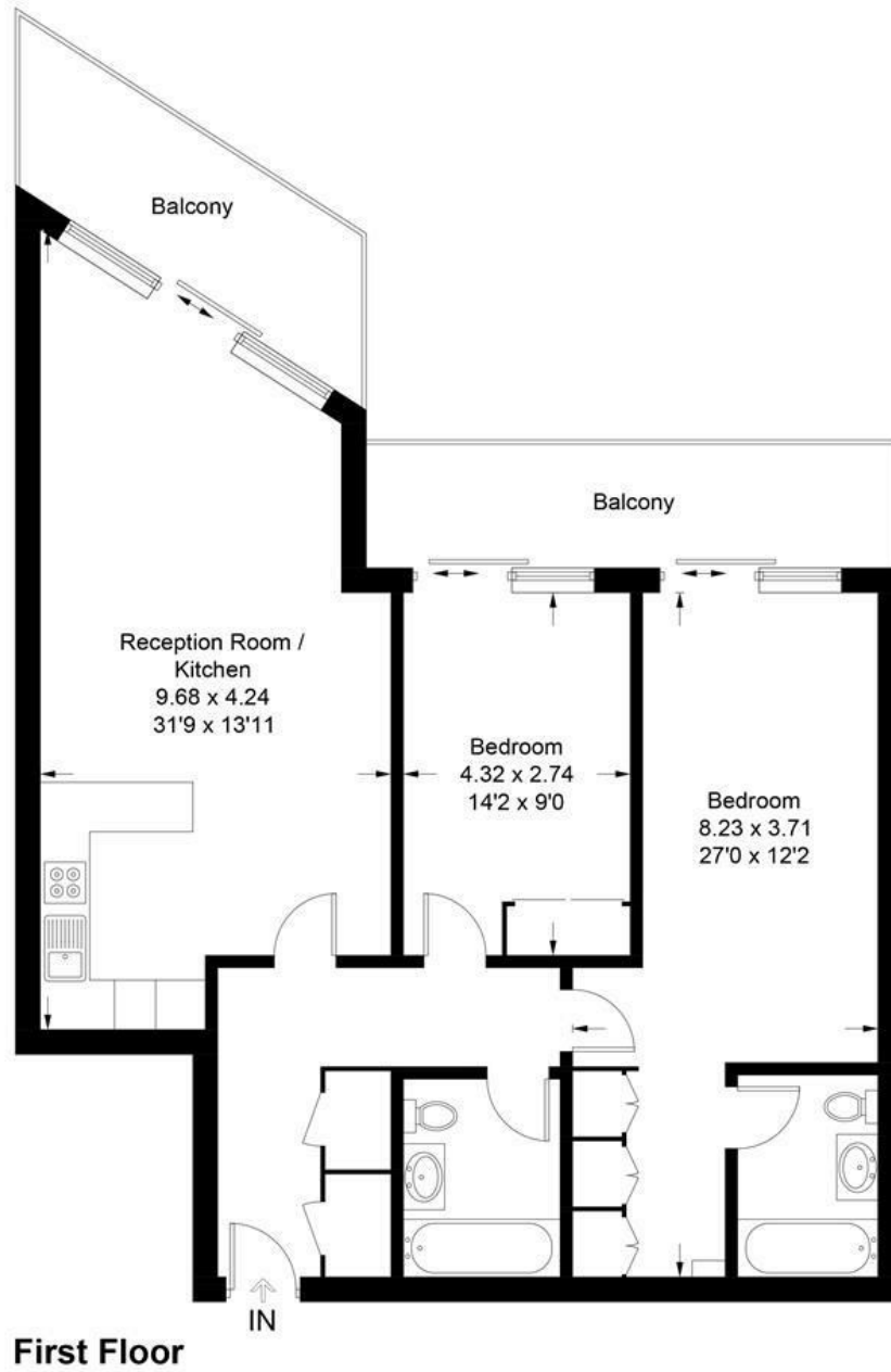
Illustration for identification purposes only, measurements are approximate, not to scale. Fourlabs.co © (ID1165649)