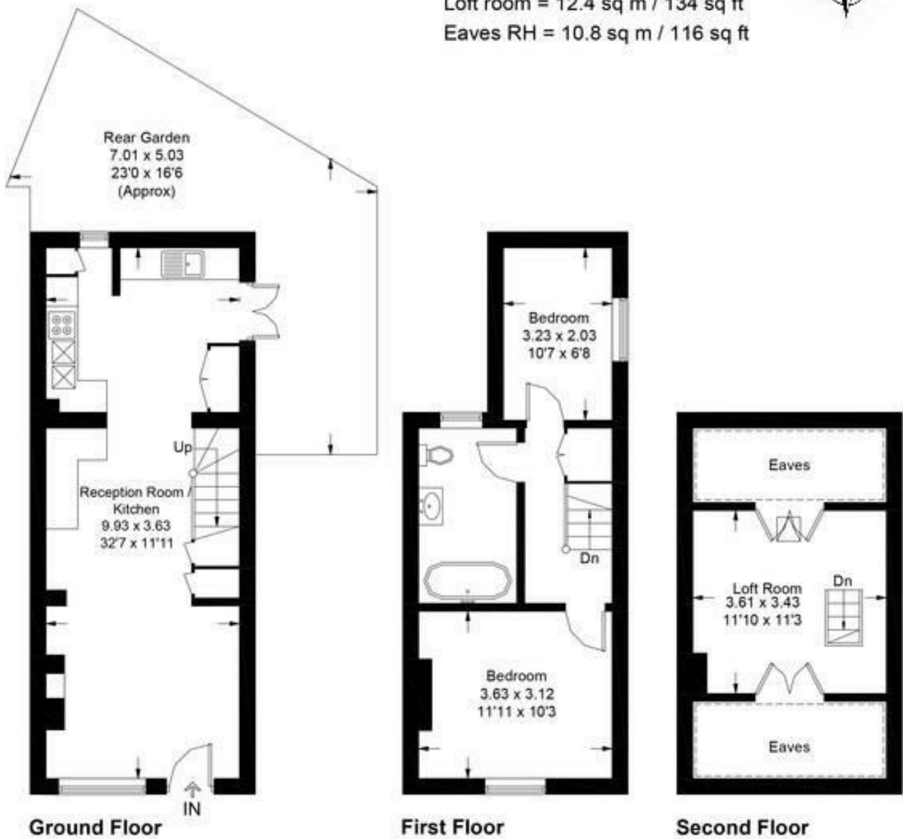
Illustration for identification purposes only, measurements are approximate, not to scale. Fourlabs.co © (ID1153293)