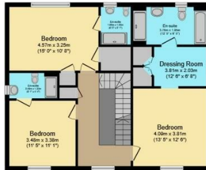
First Floor Floor area 82.6 m 2 (889 sq.ft.)