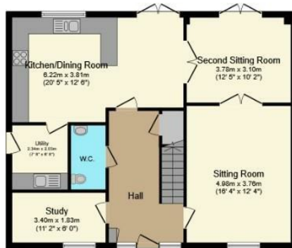
Ground Floor Floor area 82.6 m 2 (889 sq.ft.)