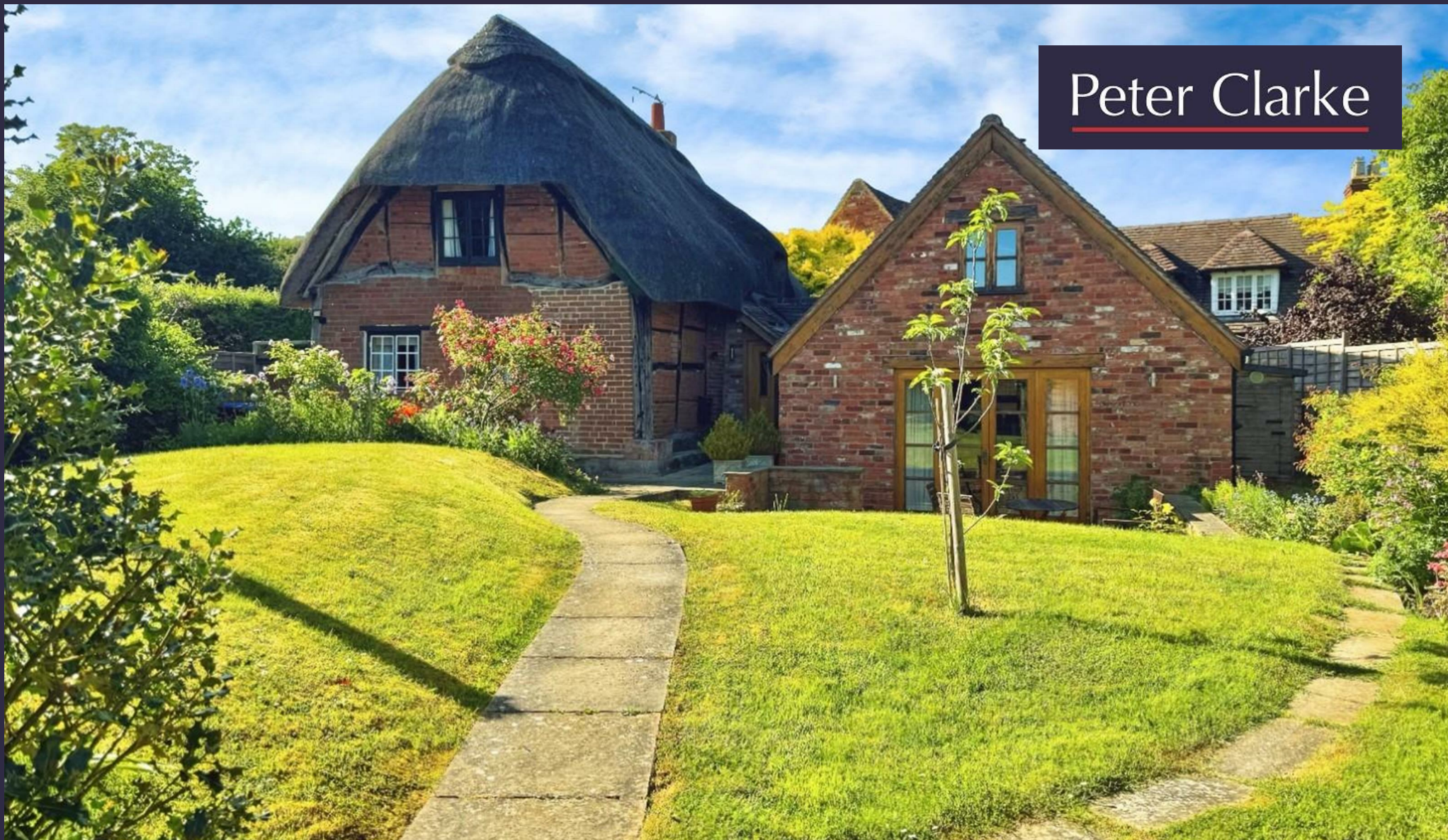
The Old Thatch, 42 Preston-on-Stour, Stratford upon Avon, CV37 8NG