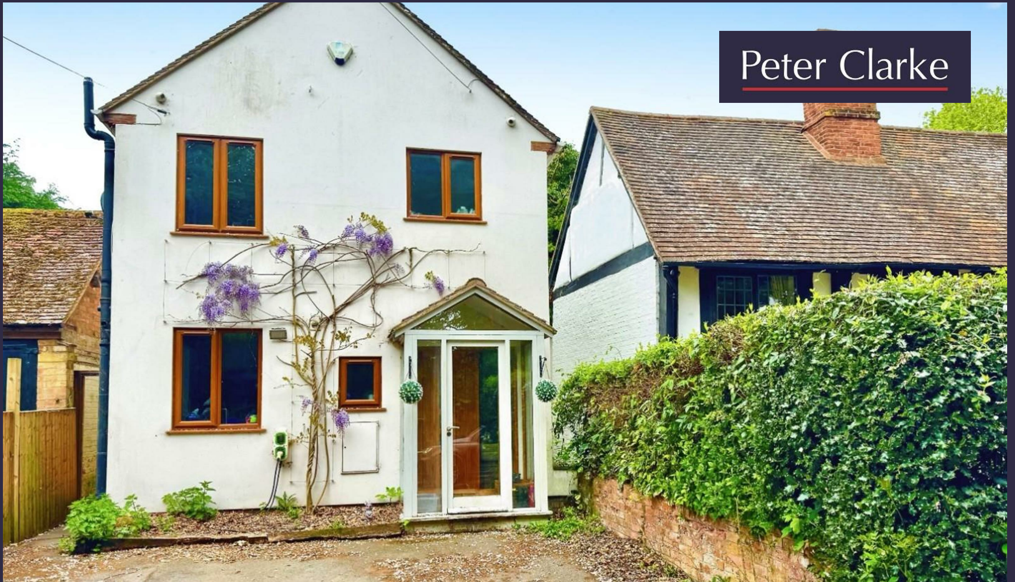
Wisteria Cottage, Mill Lane, Alveston, CV37 7QL