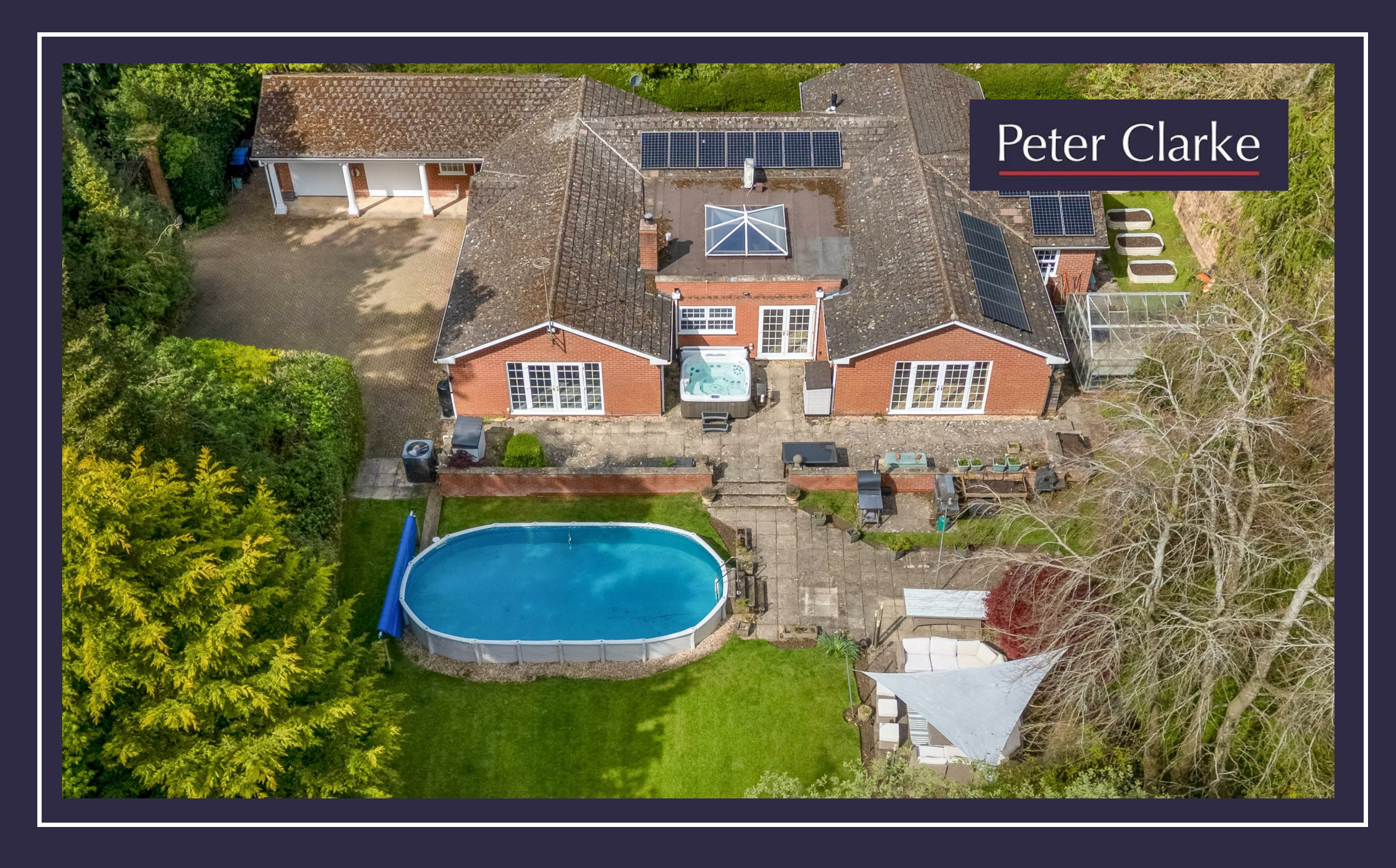
Half A Crown, Moreton Paddox, Moreton Morrell, Warwick, CV35 9BU