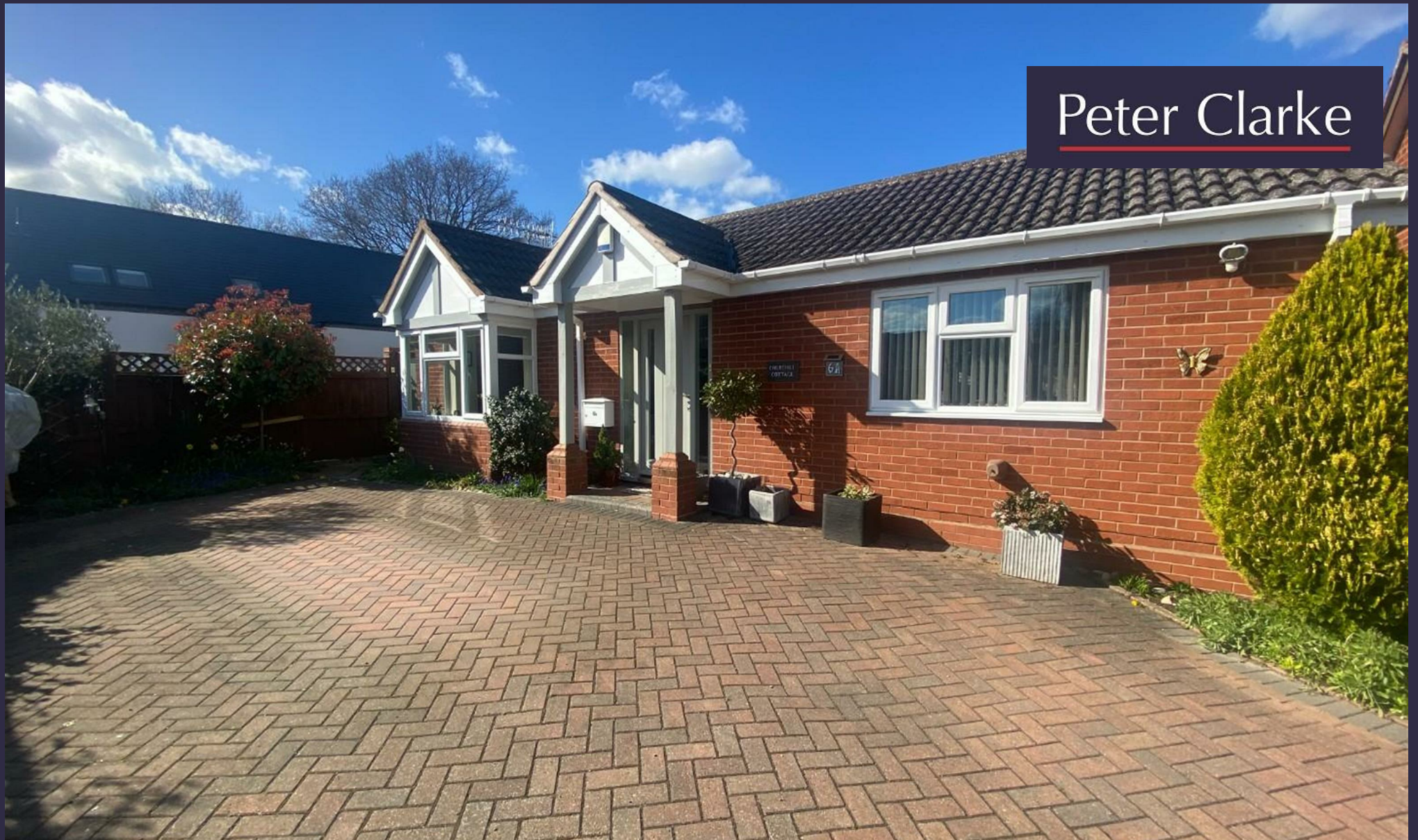
Churchill Cottage, 6A Winston Close, Shotton, Stratford-upon-Avon, CV37 9ER