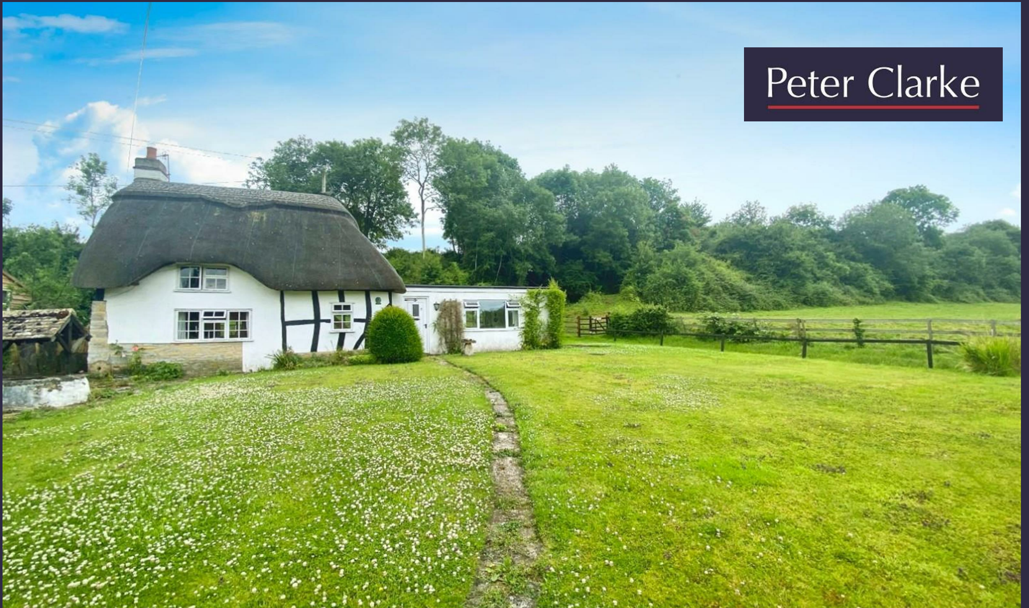
Bramble Cottage 7 The Bank, Marcliff, Bidford-on-Avon, B50 4NT